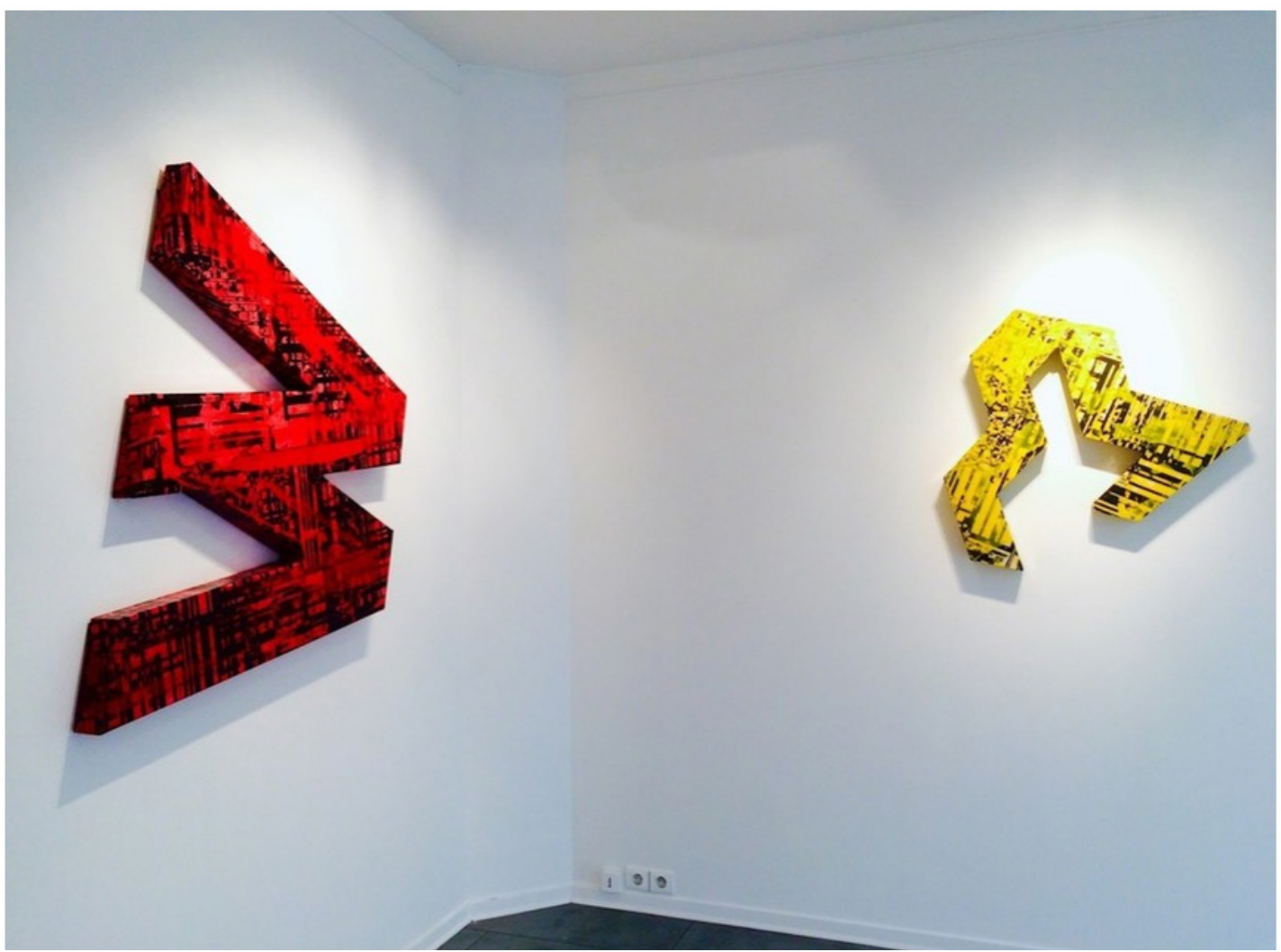
Panorama, Exhibition view.

22 Apr – 28 May 2017 at Galerie Olivier Waltman in Paris, France